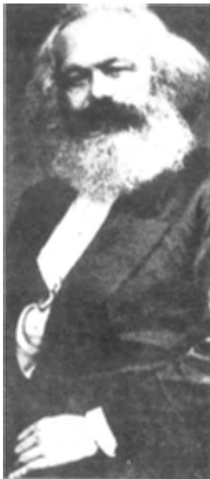
Karl Marx, the prophet who gave communism its apocalyptic creed.